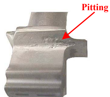
Jet Engine Turbine Blade

Attempts have been made to visually inspect the blades and determine the depth by comparing the pitting coloration to examples or templates. Visual measurements are not always repeatable because of the different individual capabilities of the inspectors. Optical comparators have also been used, but these machines lack the portability desired.